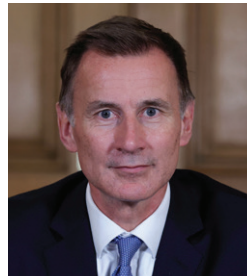
Official portrait of Jeremy Hunt MP

Some of the rumours, such as IHT reform, did not come to fruition, but there is still a chance – the Spring Budget is now less than four months away.